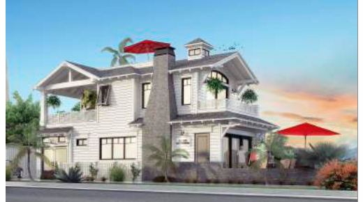
800 E Avenue 4 BR /4.5 BA/ 2,420 esf roof deck + city views

Call for Pricing and Additional Details!