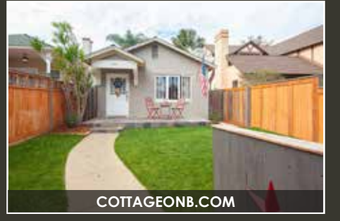
346 B Avenue 2 BR | 1 BA | 924 Sq. Ft. Offered at $1,225,000