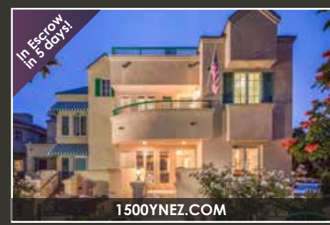
1500 Ynez Place 3 BR | 2.5 BA | 1,973 Sq. Ft. Offered at $2,199,000