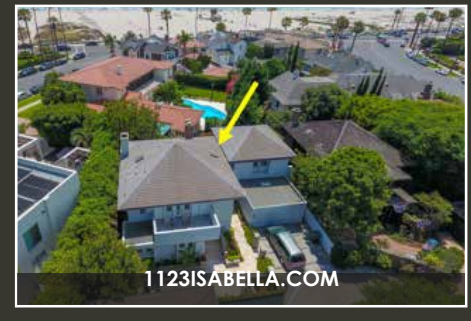
1123 Isabella Avenue 3+ BR | 3 BA | 2 Half BA | 3,075 Sq. Ft. Offered at $3,395,000