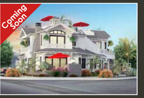
801 Olive Avenue 3 BR | 3.5 BA | 1,996 Sq. Ft. 800 E Avenue 4 BR | 4.5 BA | 2,420 Sq. Ft. Call for Pricing!

Custom designed, Falletta-Built back house! This cloud condo is stunning with gorgeous Brazilian cherry wood and stone floors throughout. "Great Room" has vaulted ceilings, kitchen equipped with granite counters, lots of storage, 36" Viking range, built-in wine fridge and living room with fireplace. Three balconies and private yard offer outdoor spaces to enjoy all year. Additional loft space is perfect an office, playroom, etc. Property includes a two-car tandem garage with built-in storage and work bench accessible from the alley. Full size washer and dryer in closet on first floor of home. Just a few blocks from Spreckles Park and schools.