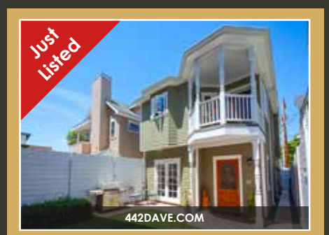
442 D Avenue Offered at $1,449,000

Call us today at 619.435.3700 for additional information on any of these homes.