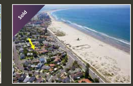
1119 F Avenue 5 BR | 4 BA | 2,586 Sq. Ft. Was Offered at $5,100,000 Represented Buyer and Seller