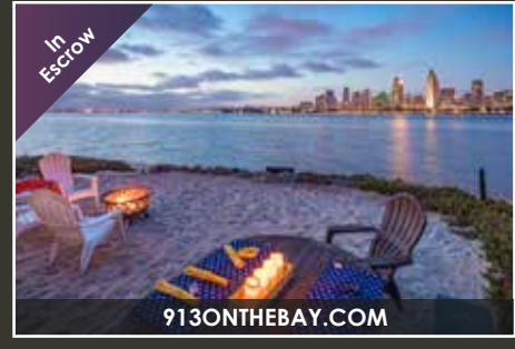
913 1st Street 4 BR | 4.5 BA | 3,750 Sq. Ft. Offered at $5,995,000