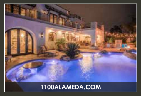
1100 Alameda 5 BR | 6.5 BA | 7,209 Sq. Ft. Offered at $6,995,000