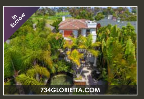
734 Glorietta 3 BR | 3 BA Main House 1 BR | 1 BA Detached Guest Suite Offered at $3,950,000 - $4,295,000