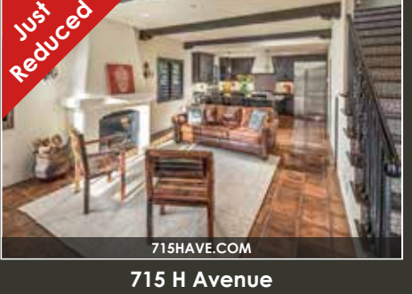
715 H Avenue 3+ BR | 2.5 BA | 2,037 Sq. Ft. Offered at $2,299,000