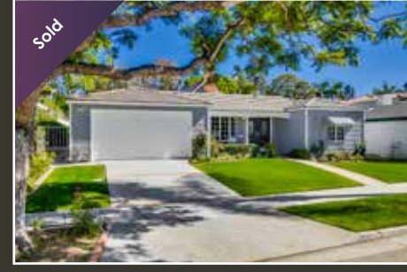
717 Guadalupe Avenue 3 BR + Den | 4 BA | 2,090 Sq. Ft Was Offered at $2,850,000 Represented Buyer and Seller